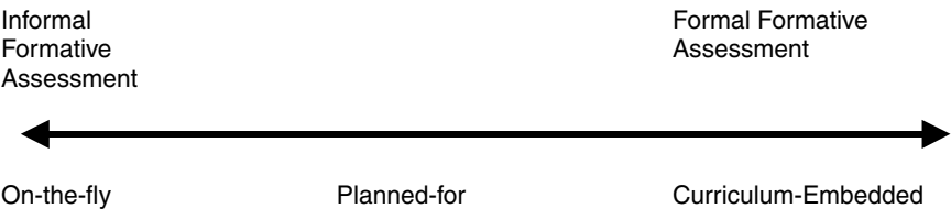
FIGURE 9-1 Continuum of formative assessment.

Formative assessment can be summarized in three central questions to be answered by the student or the teacher: Where are you going? Where are you now? How are you going to get there? (National Research Council, 2001). This three-step process summarizes what has been called the “feedback loop” in formative assessment: setting a learning goal, determining the gap between the learning goal and the student's present state of understanding, and formulating feedback to close the gap.